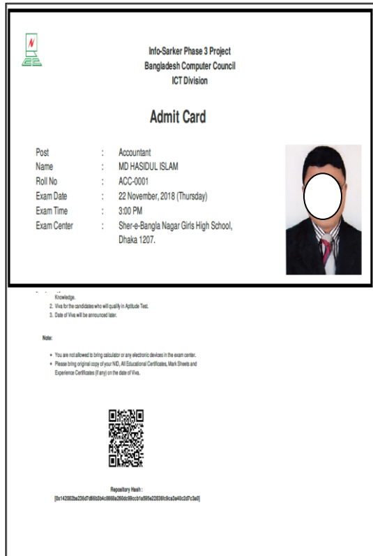
Original Admit Card

In order to make the system working, e-Recruitment system embeds a unique identifier (via QR code) in each admit card it issues. The unique identifier is in fact the DLS repository hash of the admit card. It helps to identify manipulation attempts with admit card in a fool-proof way!